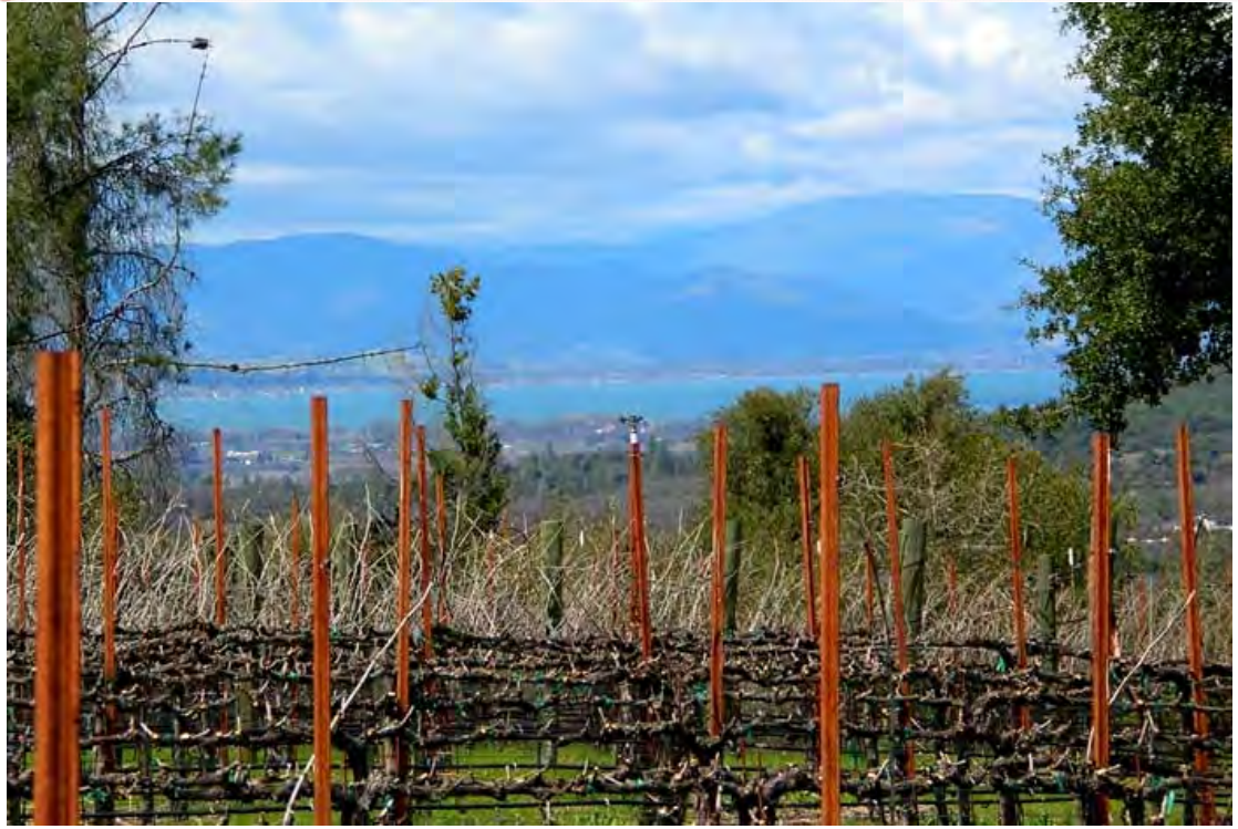
Red Hills Appellation Boutique Vineyard Estate with Spectacular Views Overlooking Clear Lake