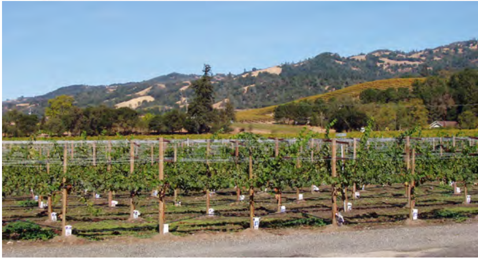
Alexander Valley Vineyard & Estate / Winery Potential